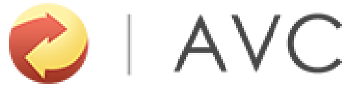
Any Video Converter